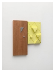
Richard Rezac Nemaha (pair), 2016 Painted cherry wood, cherry wood, aluminum 23 x 19 1/2 x 3 inches (58.4 x 49.5 x 7.6 cm)