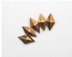
Richard Rezac Constelatie, 2024 Cast bronze 16 1/2 x 17 1/2 x 2 inches (41.9 x 44.5 x 5.1 cm)

Back Gallery (clockwise, left to right):