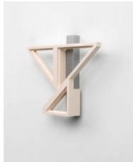
Richard Rezac Untitled (23-08), 2023 Painted cherry wood and aluminum 15 x 18 x 3 3/4 inches (38.1 x 45.7 x 9.5 cm)