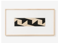
Lygia Clark Planos em superfície modulada, 1957 Collage, cardboard 5 5/8 x 21 1/4 inches (14.4 x 54 cm) Framed: 18 1/4 x 33 7/8 inches (46.5 x 86.1 cm)