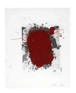
Christopher Wool Untitled, 2014 Monotypes over photogravure 18 3/4 x 15 inches (47.6 x 38.1 cm) Framed: 26 3/8 x 23 1/4 inches (67 x 59.1 cm)

531 West 24th Street New York NY 10011 tel 212 206 9100 fax 212 206 9055 www.luhringaugustine.com