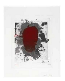
Christopher Wool Untitled, 2014 Monotypes over photogravure 18 3/4 x 15 inches (47.6 x 38.1 cm) Framed: 26 3/8 x 23 1/4 inches (67 x 59.1 cm)