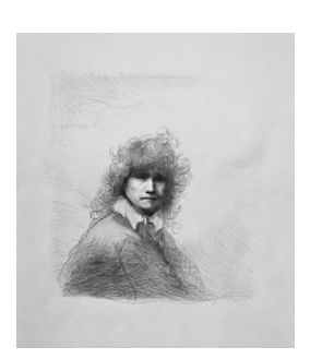
Yasumasa Morimura Face Study I, 1994 Gelatin silver print From an edition of 10 10 x 8 inches (25.4 x 20.3 cm) Framed: 24 3/4 x 12 inches (62.9 x 30.5 cm)