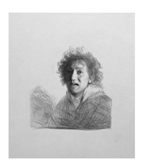
Yasumasa Morimura Face Study VII, 1994 Gelatin silver print From an edition of 10 10 x 8 inches (25.4 x 20.3 cm) Framed: 24 3/4 x 12 inches (62.9 x 30.5 cm)