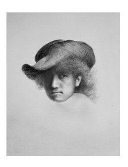
Yasumasa Morimura Face Study VI, 1994 Gelatin silver print From an edition of 10 10 x 8 inches (25.4 x 20.3 cm) Framed: 24 3/4 x 12 inches (62.9 x 30.5 cm)