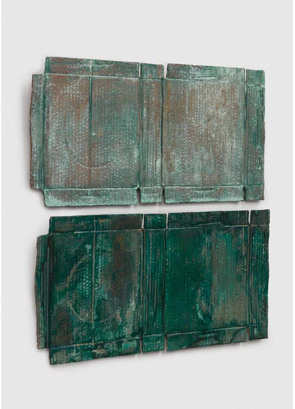
Pictured: 1. Untitled (Silver Pallet), detail, 2021, lacquered silver; 2. Untitled (Rose Gold and Blue), detail, 2022, papier mache and silver leaf; 3. Untitled (Lavender and Pink), detail, 2022, papier mache and silver leaf; 4. Untitled (Blue and Black), detail, 2022, papier mache, silver leaf and gouache; 5. Untitled (Clump), 2021–2022, bronze, steel, wood and paint; 6. Untitled (Dusk Notes) I, 2022, resin and steel; 7. Untitled (Green), 2020–2022, copper and patina, (2 parts).

Throughout my ongoing research about this subject, I have learned from Rachel's practice undeniable elements associated with the theme of memory, such as giving the viewer the space, patience, and time to meaningfully understand a conceptual artwork. Our empathic response to Rachel's works is not necessarily a function of belonging to a nation; we respond differently and remember together. This may explain why this Iraqiborn artist is so deeply invested in Rachel's work.